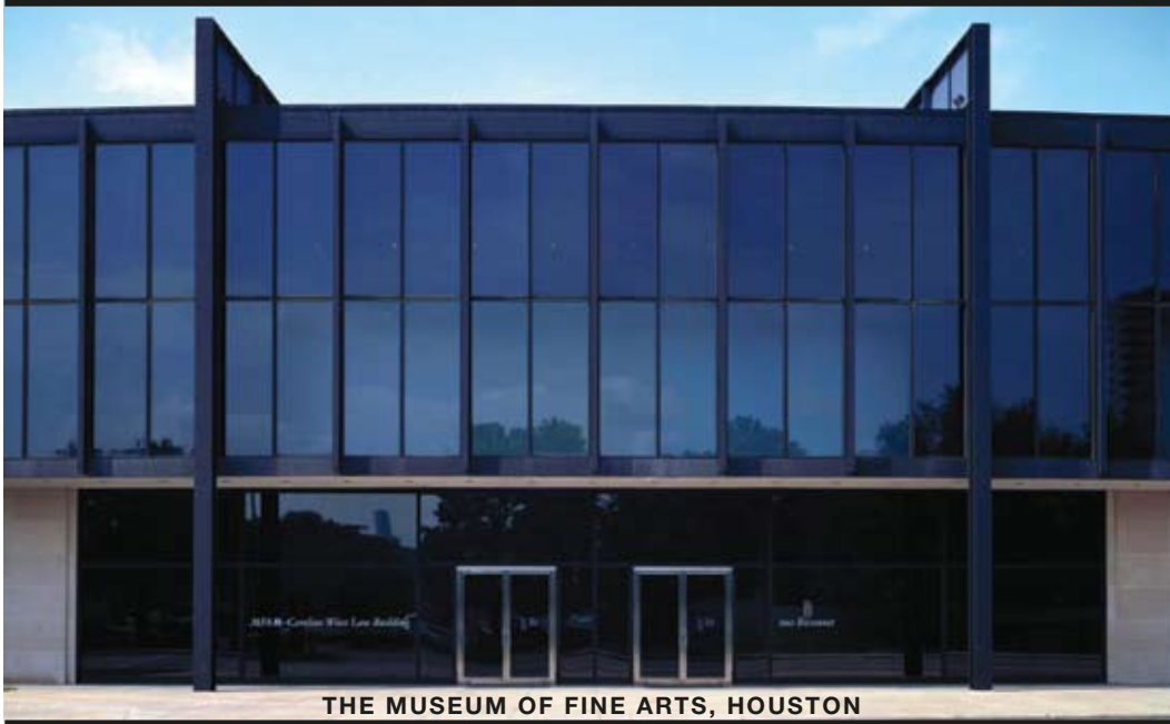
THE MUSEUM OF FINE ARTS, HOUSTON