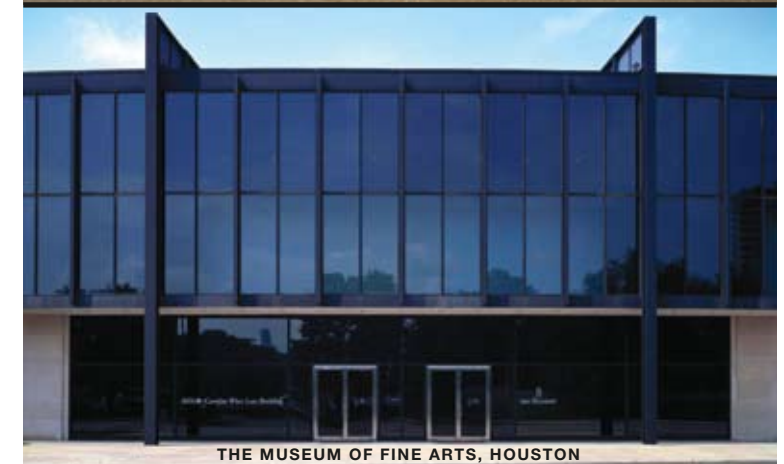
THE MUSEUM OF FINE ARTS, HOUSTON