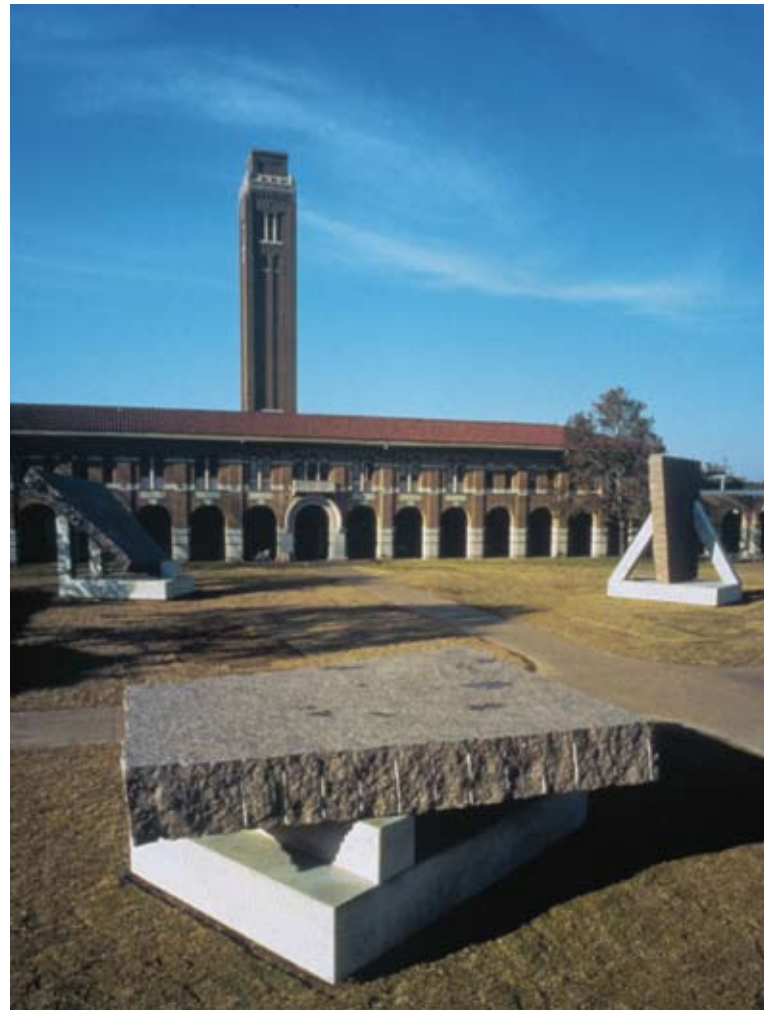
Michael Heizer, 45 degrees, 90 degrees, 180 degrees , 1985, Rice University